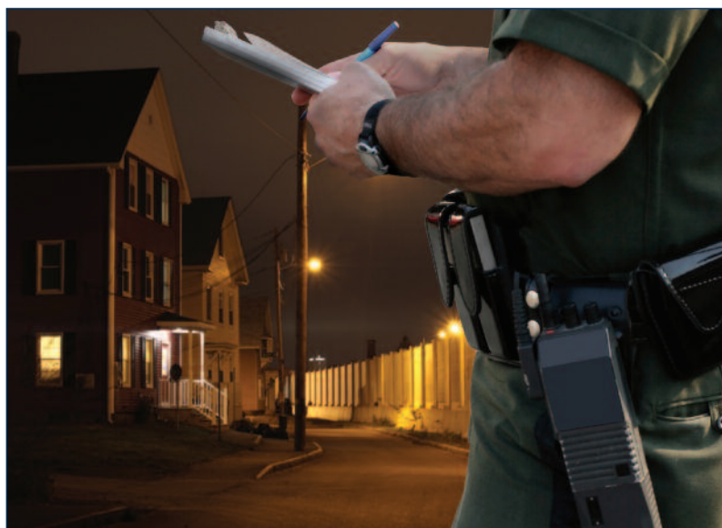
Handle noise complaints easily with N/Forcer Noise Meter System