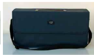
Bag of transport BAG50