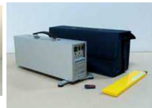
LOOK THE PHOTO